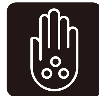
Magnetic Acupressure for Hands