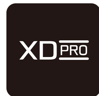
Advanced XD Massage Module