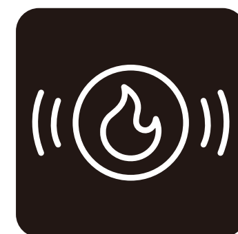
Heat Applied Massage