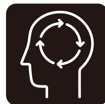
Voice Guided Meditation Massage