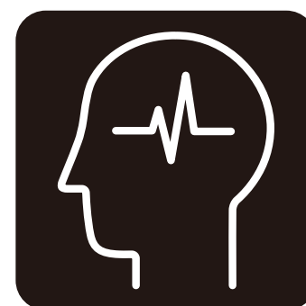
Brain Massage with Binaural Beat