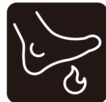
Warming up the soles